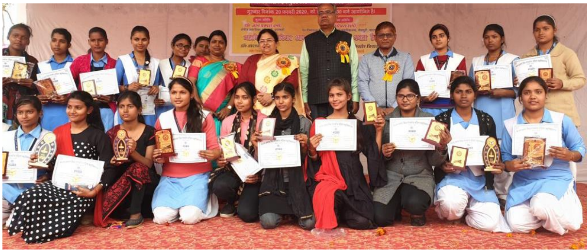
Toppers & university rank holders are being felicitated on Annual Day