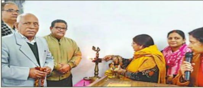
केशव प्रसाद मिश्र महिला महाविद्यालय में व्याख्यान माला का शुभारंभ करते अतिथिगण।